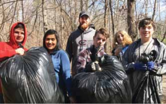
Chestatee High students and teacher-sponsors participated in the February and March 2019 'Honeysuckle Sweep' along Dodd Trail.